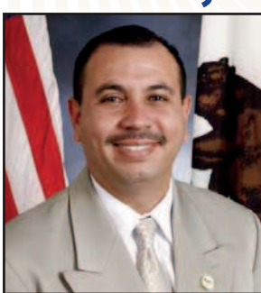
California Senator Tony Mendoza